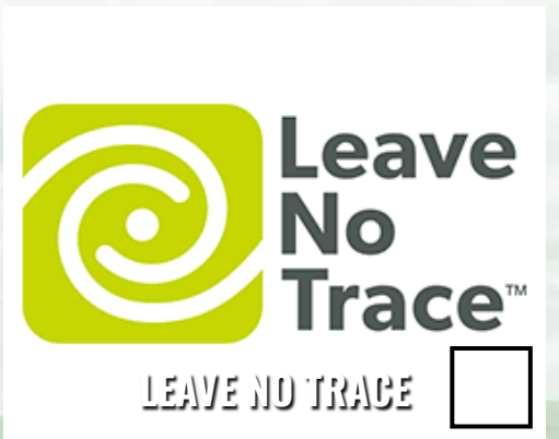
LEAVE NO TRACE