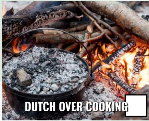
DUTCH OVER COOKING