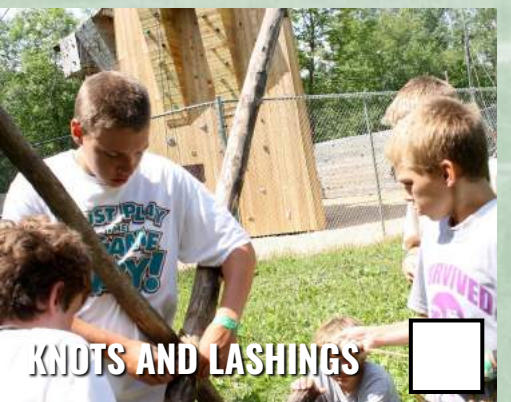
KNOTS AND LASHINGS

More Information Online — www.ManyPoint.org