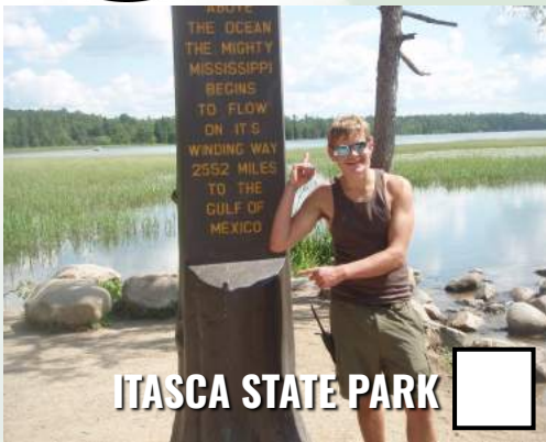
ITASCA STATE PARK