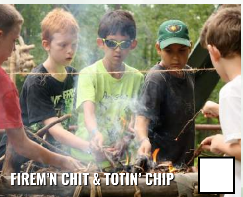
FIREM'N CHIT & TOTIN' CHIP